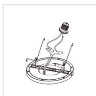
Recess Can Retrofit